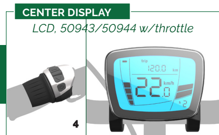
CENTER DISPLAY LCD, 50943/50944 w/throttle