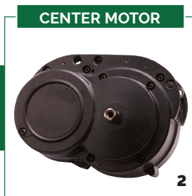
Centermotor with speed sensor, w/freewheel (50970)