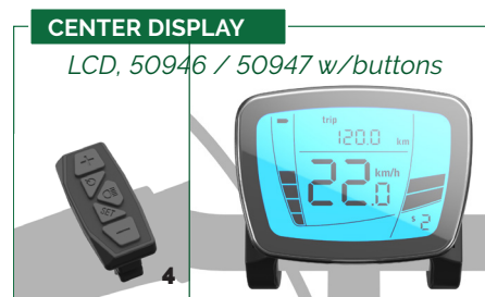
CENTER DISPLAY LCD, 50946 / 50947 w/buttons