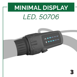
MINIMAL DISPLAY LED, 50706